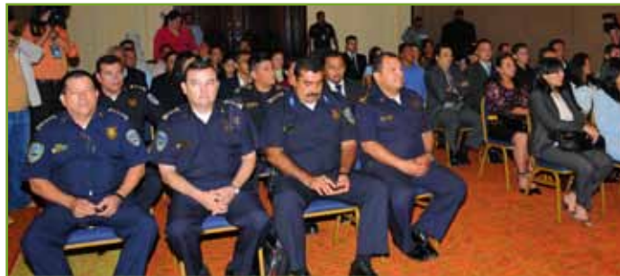
The inauguration ceremony for the "Train the Trainer" course in Honduras.