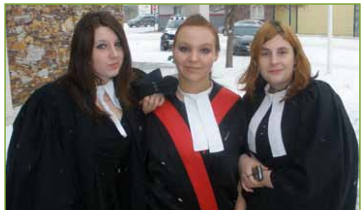
Three students show off their mock trial costumes during a visit to the Society's Northern Office at the Prince George courthouse.