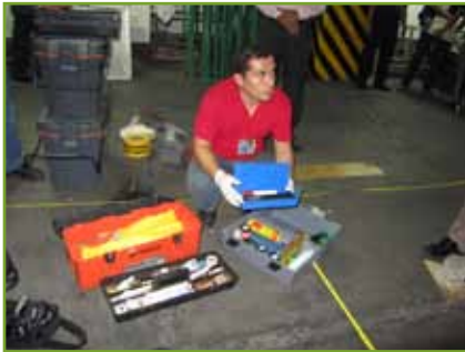
A Guatemalan crime scene specialist demonstrates investigation tools.

Funder: Department of Foreign Affairs and International Trade's Anti-Crime Capacity Building Program