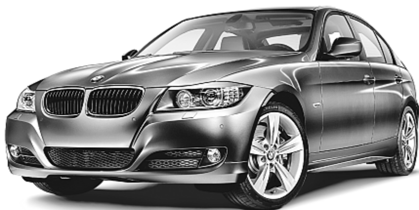
2009 BMW 335i shown.

» 4-Year / 80,000 Km No-Charge Scheduled Maintenance